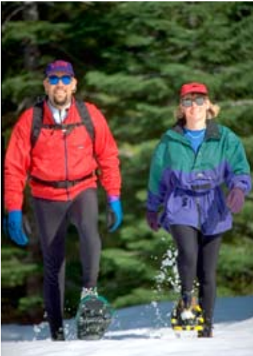
A snowshoe hike will re-energize the staff.