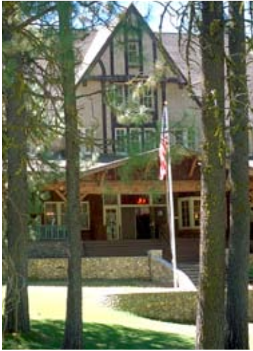
The historic Feather River Inn in Graeagle has complete conference facilities.