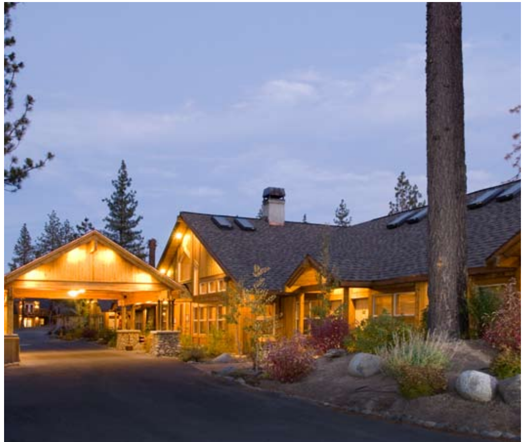
Chalet View Lodge, located between Portola and Graeagle.

For more information on this tour , or for alternate locations for smaller retreats, contact the Plumas County Visitors Bureau at 800-326-2247 or visit www.plumascounty.org .