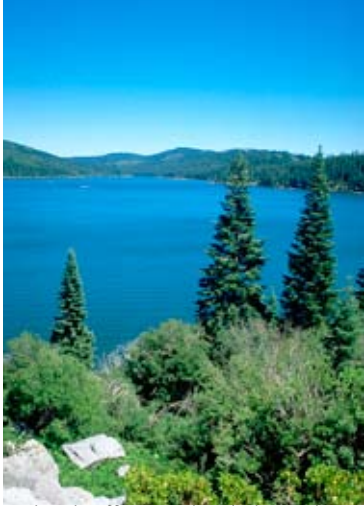
Bucks Lake offers a rustic, relaxing setting.