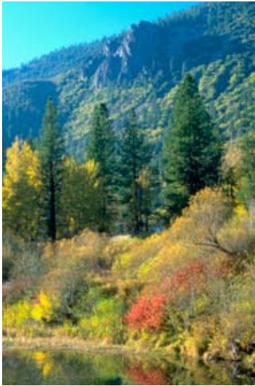
Organize a corporate meeting in the autumn to take advantage of spectacular fall foliage.

Plan a real retreat for your staff in the mountains of the Northern Sierra. Combine business with outdoor fun in a relaxing, rural setting.