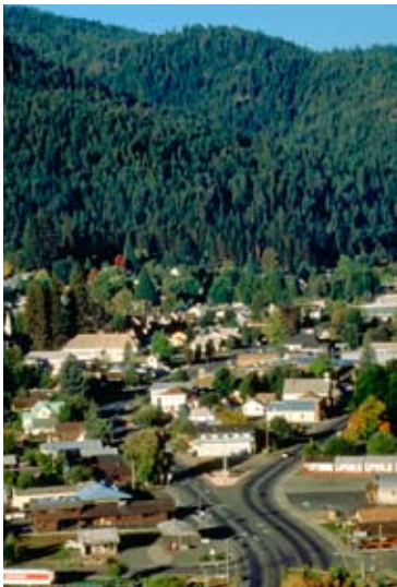
Quincy has small town charm and amenities.

Evening entertainment can include a movie at the historic Town Hall Theatre on Main St. in Quincy or a community concert or show (depending on schedule.) Athletic and other events are often available at Feather River College and area high schools. You can also workout at fitness centers or try out your skill at the bowling alleys in Chester and Quincy.