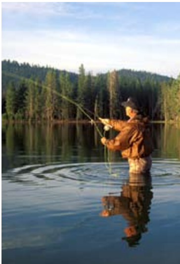
Work in some fun with a bit of fly-fishing.

Plan a real retreat for your staff in the mountains of the Northern Sierra. Combine business with outdoor fun in a relaxing, rural setting.