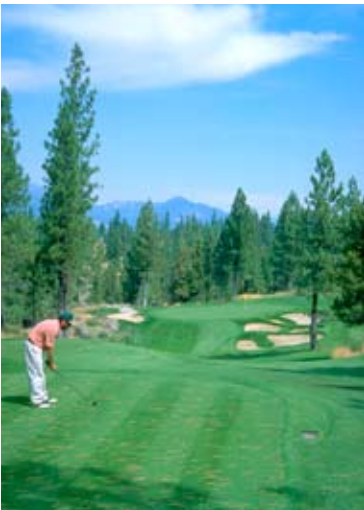
After the meeting, enjoy a round at one of several challenging mountain golf courses.