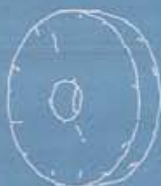
Rolling made easy: 3500 BC