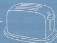
Toast made easy: 1919

myPlan® Retirement planning made easy. Fidelity.com/myPlan