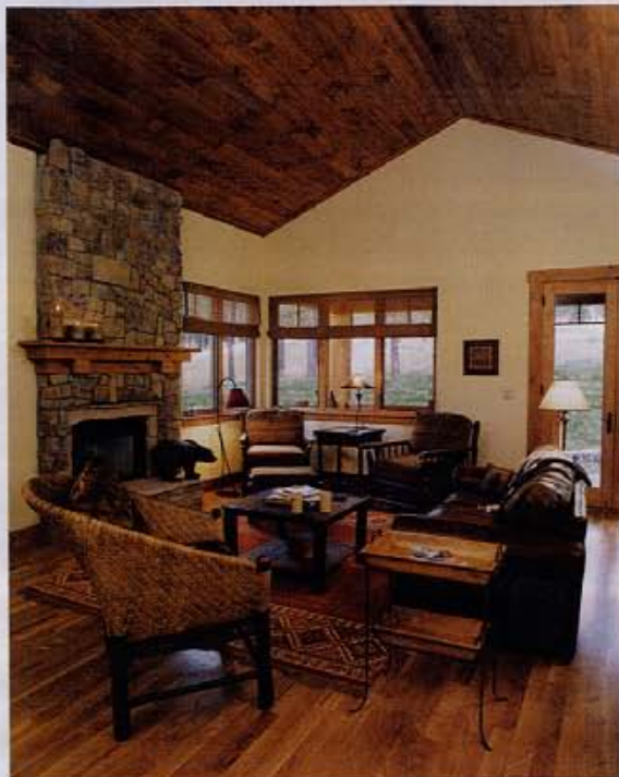
A CABIN LIVING ROOM AT GRIZZLY RANCH, IN PORTOLA, CALIF.

Aside from the golf, Arizona is an adult play-