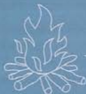
Heating made easy: 10,000 BC