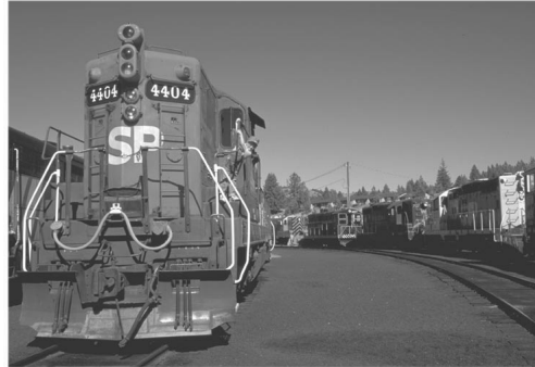
Portola Railroad Museum

7 East of Portola at Chilcoot is a 6,002 foot tunnel that penetrates the Sierra and brings the Union Pacific out onto the desert at Reno Junction. The mainline continues eastward across the Smoke Creek and Black Rock deserts through an endless sea of sand and sage brush to Salt Lake City.